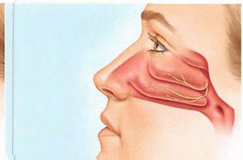
After ClariFix ®